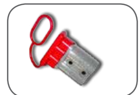
Connector dust cover